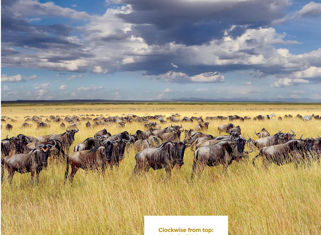
Clockwise from top: Herd of wildebeest; Maasai Mara student; Greetings from a giraffes.

Experience bucket-list moments in this diverse country.